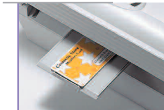
Straight Path for Card Scanning

Compact, powerful, and fast. The Canon DR-2580C color scanner is designed to meet the diverse imaging needs of your busy office. This innovative device offers you the most advanced features in document scanning. Boasting record speeds for scanning and saving to searchable PDF has earned the DR-2580C scanner PC Magazine's Editors' Choice award. Not surprising since it's from Canon, the brand the world relies on for the latest solutions in imaging technology.