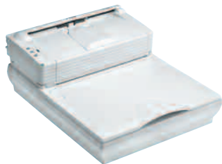
DR-2580C with Optional Half Letter-Sized Flatbed Unit