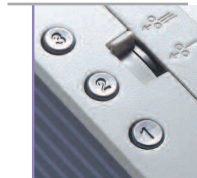
Scan-To-Job Buttons for One-Touch Operation