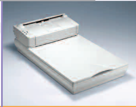
DR-2580C with Optional Flatbed Scanner

The DR-2580C scanner is not only one of the smallest and most versatile in its class, but also incredibly easy to use. For one-touch operation, simply assign your most common functions to its customizable Scan-To-Job buttons. You'll be able to enhance black-and-white scans with the Contrast Adjustment feature that sharpens images and makes text more distinctive on low-contrast documents. And you'll consistently capture high-quality images thanks to 3-Dimensional Color Correction technology, and a built-in shading board automatically adjusts shading prior to each and every scan job.