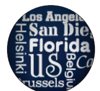
Select from 8 fonts, 10 type styles and 20 frames